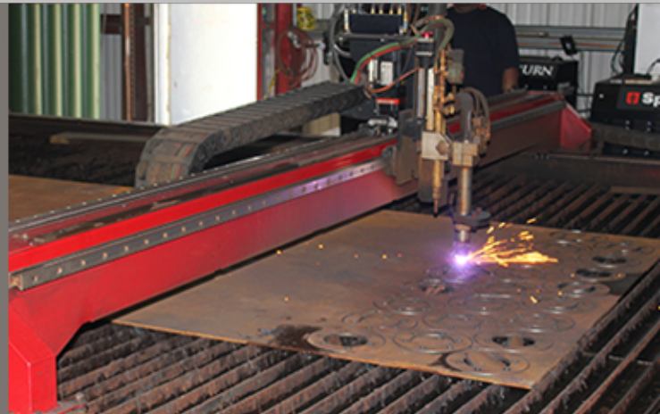
4 CNC PLASMA MACHINES