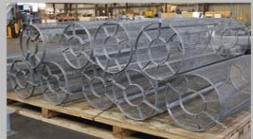
Personnel Protection Shields