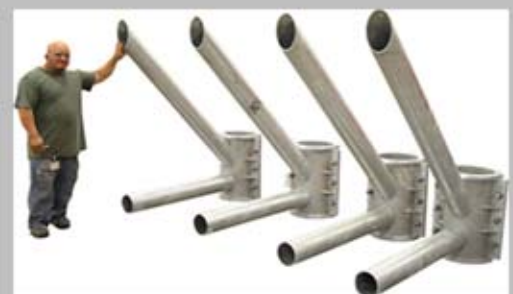
Structural Pipe Hangers with MegaLug® Pipe Attachments for the San Francisco-Oakland Bay Bridge