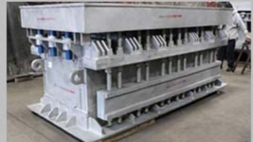
Mega Ton Spring Support with Bronzphite® Slide Plates

Graphite PTFE 25% Glass Filled Bronzphite® Marinite® Stainless Steel