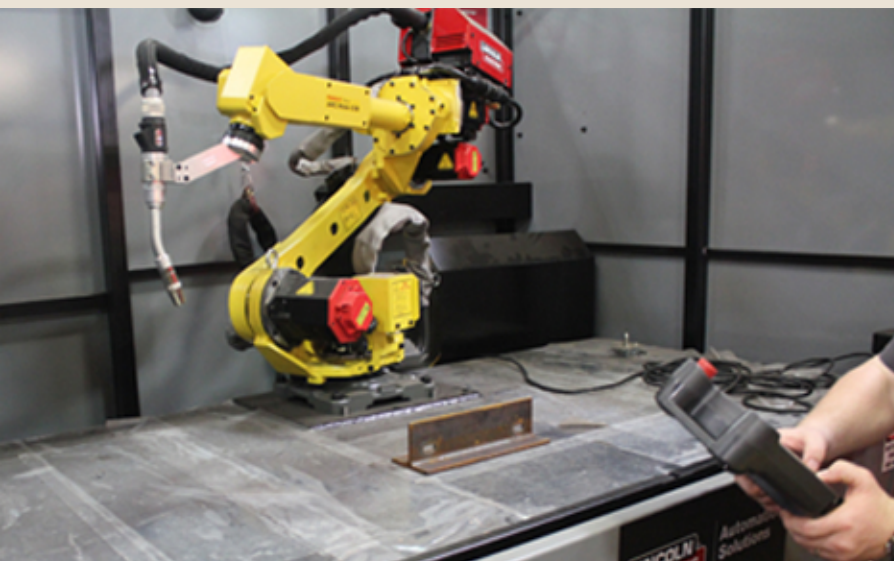
50+ WELDERS & FITTERS